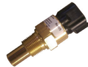
ETS Series Temperature Sensors