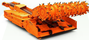
Mining & Construction Proven durability in high shock and vibration environments.