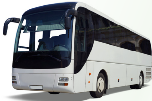
Specialty Vehicles Handles powerful wash downs.