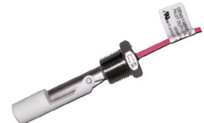
LS-7 Float Reed Switch