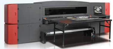
Printing Small footprint, lets XLS-1 easily fit into existing systems.