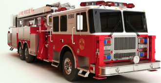
Municipal Safety Designed to be dependable even with intermittent heavy use.