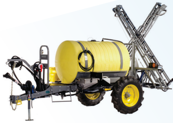
Agricultural Dependable performance in unique chemical exposures.